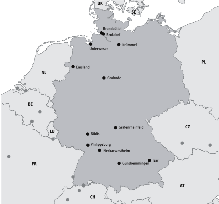
FIG. 1: Nuclear power plant sites in and close to Germany, March 2011

Note: German nuclear power plant (NPP) sites are marked by black dots and with name. Foreign NPPs are marked by grey dots and without name.